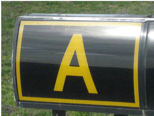
Taxiway Location Sign

Location Signs have yellow lettering on a black background . The location sign below indicates that the operator of the vehicle/equipment is located on the named taxiway or runway.