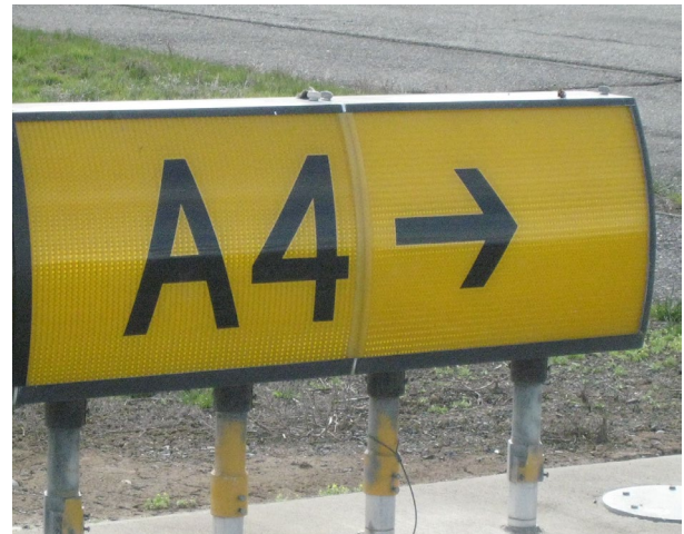
Taxiway Directional Sign