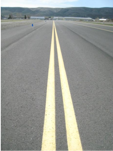
Solid double yellow line on Taxiway C

Markings. Pavement markings on taxiways are always yellow . The taxiway centerline is painted on all taxiways. On the edges of some taxiways, there is a solid, double yellow line or double-dashed line. If pavements are usable on both sides of the line, the lines will be dashed; if not, the lines will be solid. Examples of these markings are located on Taxiway C, Cub Crafters, and the Commercial Ramp.