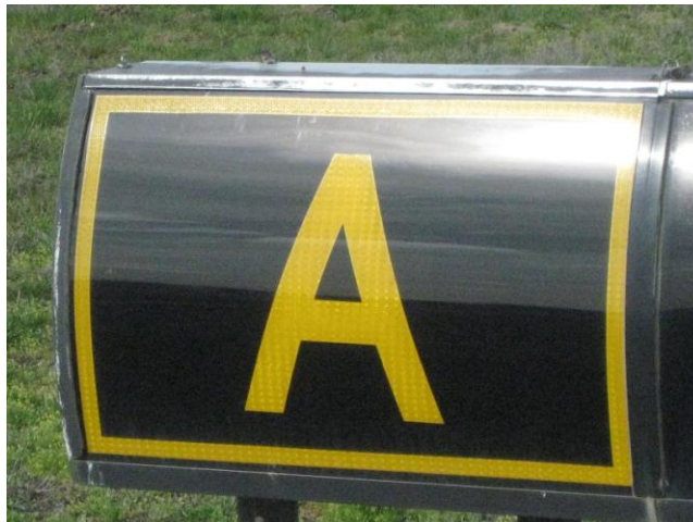
Taxiway Location Sign

Location Signs have yellow lettering on a black background . The location sign below indicates that the operator of the vehicle/equipment is located on the named taxiway or runway.