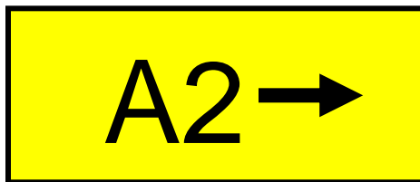
Runway Exit Sign

Runway Exit Sign is a destination sign located prior to the runway/taxiway intersection on the side and in the direction of the runway where the aircraft is expected to exit. This sign has black lettering and a directional arrow on a yellow background .