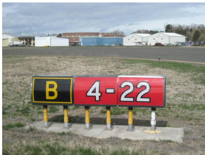
Runway Hold Sign

Mandatory Holding Position Signs for Runways have white numbering/lettering on a red background with a white border . These are located at each entrance to a runway and at the edge of the runway safety area/obstacle-free zone and are co-located with runway holding position markings. Do not proceed beyond these signs until clearance is given by the ATCT to enter onto the runway.