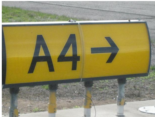
Taxiway Directional Sign

Location Signs have yellow lettering on a black background . The location sign below indicates that the operator of the vehicle/equipment is located on the named taxiway or runway.