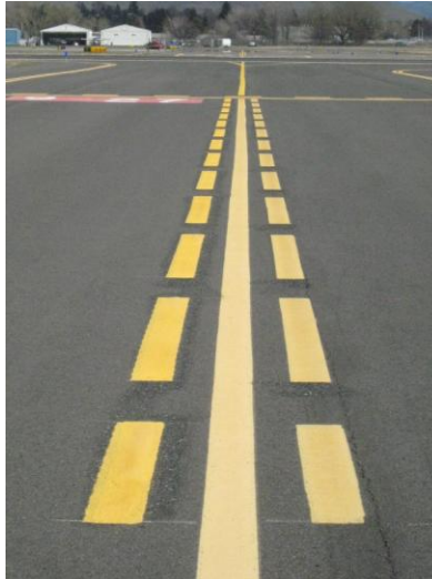
Enhanced Taxiway Centerline Markings

Enhanced Taxiway Centerline Markings are present at YKM and appear before a runway hold line, as illustrated below. These markings are intended to serve as an additional warning to flight crews that they are approaching the runway.