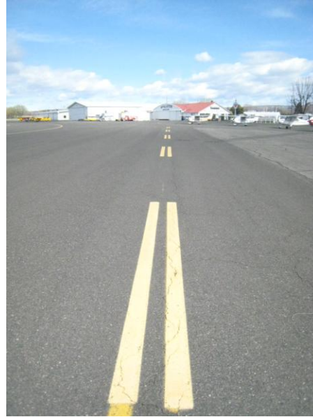
Double dashed yellow line by Cub Crafters