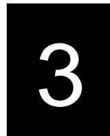
Runway Distance Remaining Signs

Runway Distance Remaining Signs provide distance remaining information to pilots during takeoff and landing operations. They have white numbering on a black background . The number on the sign provides the remaining runway length in 1,000-foot increments.