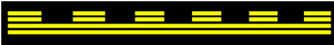
Runway Holding Position Marking

Runway Holding Position Markings are located across each taxiway that leads directly onto a runway. These markings are made up of two solid lines and two broken yellow lines and denote runway holding position markings. These markings are always co-located with a Runway Holding Position Sign. A vehicle operator must not cross from the solid-line side of the marking without first obtaining clearance.