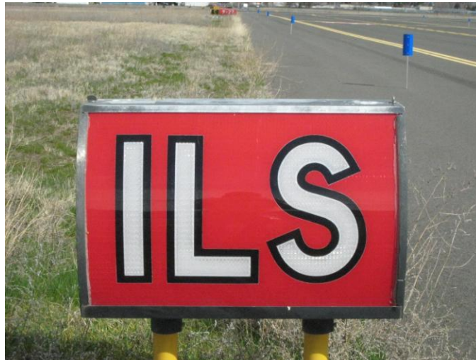
ILS Hold Sign

Instrument Landing System (ILS) Holding Position Signs have white letters on a red background with a white border . These signs tell pilots and vehicle operators where to stop to avoid interrupting a type of navigational signal used by landing aircraft. This is a critical area, and a vehicle/equipment operator must remain clear of it. If a vehicle proceeds past this ILS marking, it may cause a false signal to be transmitted to the landing aircraft. This sign is adjacent to the ILS Hold Position Marking on Taxiway C.